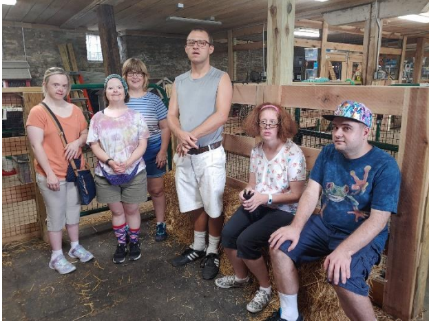
Give Back Crew Chisholm MetroPark – Historic Farmstead 7/8/2021