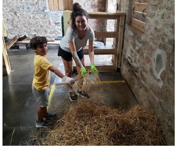
Farm Caretakers Chisholm MetroPark – Historic Farmstead 7/14/21