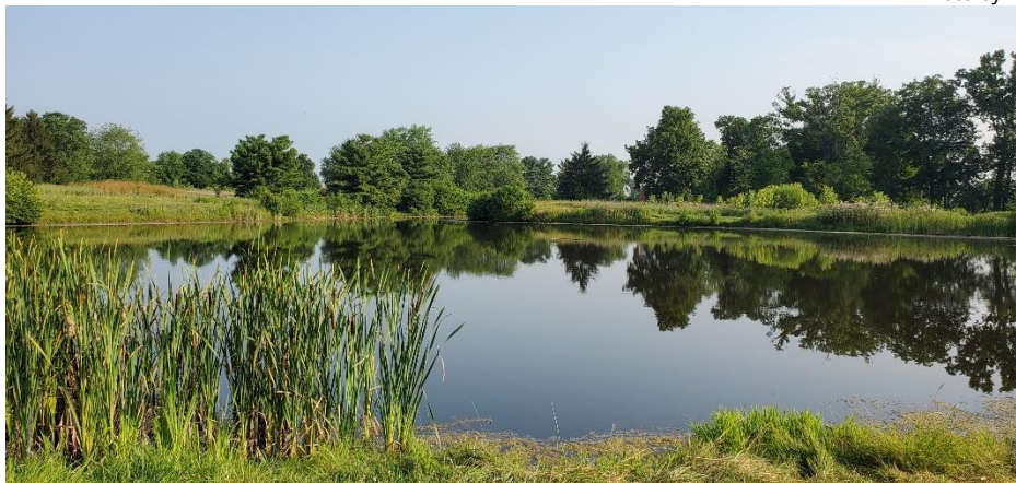
Elk Creek MetroPark – Meadow Ridge area.