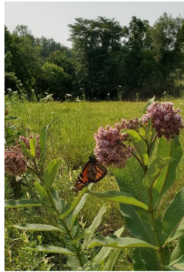
Elk Creek MetroPark – Meadow Ridge area