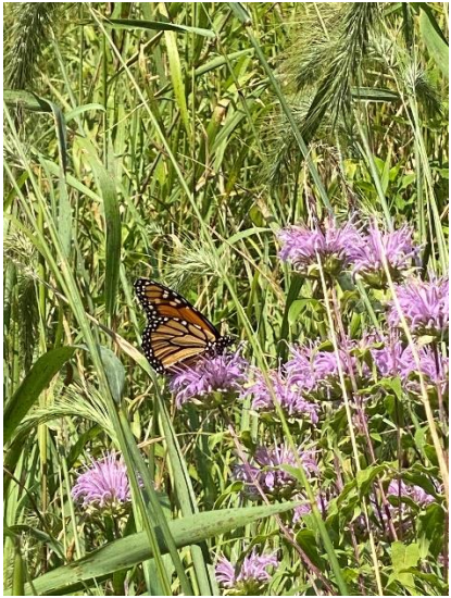
Four Mile Creek MetroPark – Mill Race area.